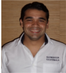
Vicepresidente Centroamérica/ Vice President Central America