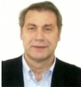
Vicepresidente Sudamérica/ Vice President South America