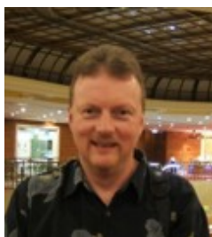
Tesorero / BPAC Treasurer Miembro BWF/ BWF Council Member